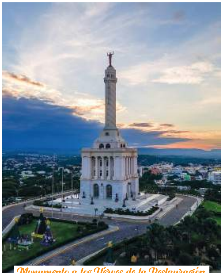
Monumento a los Héroes de la Restauración

THE ORDER OF ACTIVITIES MAY VARY WITHOUT AFFECTING THE ITINERARY CONTENT.